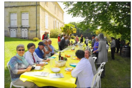
Enjoying a picnic at a small chateau-winery