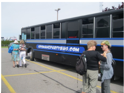
The famous Spokane Party Bus, where an easy-to-wash aluminum interior, drink holders and a disc jockey set-up were hidden behind the blacked-out windows.

After sad goodbyes, twelve of us flew on to Seattle on June 10th. There we were met at the airport by Whidbey Island day hosts for lunch and a walking tour of the city. From there we took both a train and ferry to where we were greeted by our island hosts. The next few days were a bustle of activities, exploring the tidal pools, spending a day at the Victorian town of Port Townsend, enjoying a picnic at breathtaking Deception Pass on Puget Sound, and traveling on tours of the island, which included a lavender farm. Again sad goodbyes were said as we made our way to the airport and on to other adventures. All came home with great memories of our hosts and their cities.