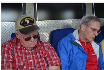
Too much sampling of the grape? OR maybe just too much excitement for these two guys, who were missing their afternoon naps.