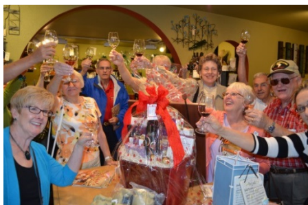
The first of three wine tasting stops of the day. FFGA Ambassadors raise their glasses high in salute to their Spokane hosts.

We were escorted around the attractive downtown riverfront through which cascaded the mighty Spokane River and was the site of what the natives claimed was the famous "Expo '74." Most of us were too young to remember 1974, but we feigned interest. We went on a wine-tasting tour on the "Spokane Party Bus," but there was a large sign inside the bus that stated "What happens on the Party Bus stays on the Party Bus," so I can say no more. We also had a delightful journey into exotic Idaho for a day-long boat ride on Lake Coeur D'Alene. We saw ospreys and eagles and they had a make-your-own Bloody Mary bar which was enjoyed by some expedition members.