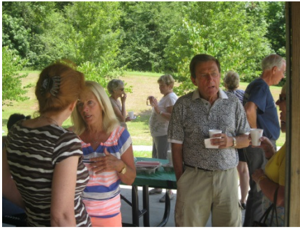
FFGA members & guests socializing with a Pineapple Smoothie prior to start of picnic.