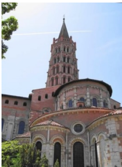
Basilica of St. Sernin