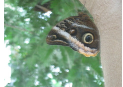
It is nice and warm in the butterfly house

After a big breakfast on Sunday it was time to head downtown to tour some of Atlanta's premier attractions. We started by strolling through Centennial Olympic Park and entering the Georgia Aquarium. After lunch we drifted over to the World of Coca-Cola. We had planned on visiting the Sundial lounge atop the Westin Peachtree Hotel but on high but low clouds made it necessary to save that for another day.