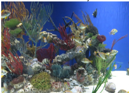
Not all of the fish in the aquarium are big