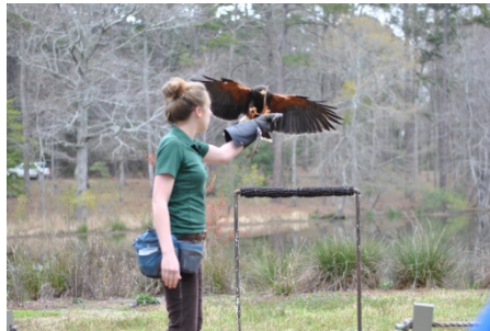
They really enjoyed the Birds of Prey Show