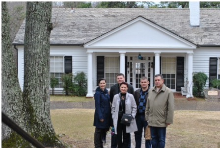
Delegates pose before the Little White House

The weekend was filled with touristy type activities before the more formal program of events was to take place. On Saturday we went first to Roosevelt's Little White House in Warm Springs. The next stop was in Callaway Gardens where the Ukrainians were delighted to see flowers blooming, after departing their homes where there was 12 to 36 inches of snow. They also enjoyed the Birds of Prey Show and the Cecil B. Day Butterfly Center.