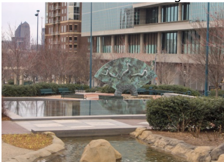
Centennial Olympic Park with bronze artwork

After a big breakfast on Sunday it was time to head downtown to tour some of Atlanta's premier attractions. We started by strolling through Centennial Olympic Park and entering the Georgia Aquarium. After lunch we drifted over to the World of Coca-Cola. We had planned on visiting the Sundial lounge atop the Westin Peachtree Hotel but on high but low clouds made it necessary to save that for another day.