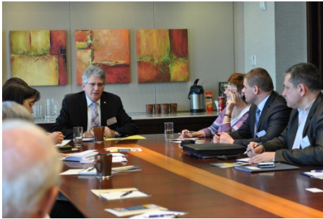
Having a discussion of legal ethics with a senior lawyer at a prestigious Atlanta law firm.

A special word of thanks is extended to all of those who supported the exchange by sponsoring a dinner in their homes for both the FFGA hosts and their Ukrainian delegates during this extremely busy week. It provided a much needed respite for all.