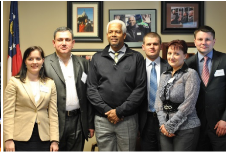
Meeting with Hank Johnson, Georgia's Fourth District U.S. Congressional Representative.