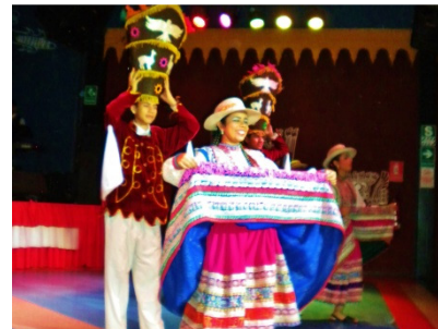
Professional dancers at nightclub