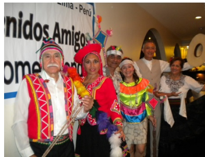
Lima's members in historical dress