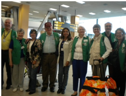
The "Green-Go's of FFGA Arrive.

the Pacific Ocean with many parks and a modern diverse culture that takes pride in showing respect for its long history and ancient traditions.