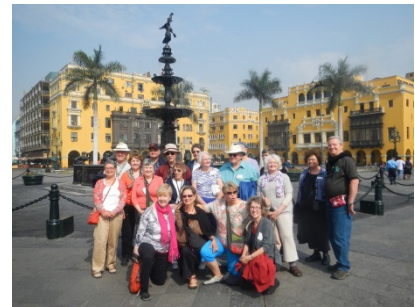
Ambassadors pose in Plaza de Armas