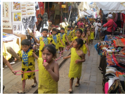
A cathedral on the Cuzco main plaza World heritage site of Machu Picchu Children's fiesta parade in Pisac market